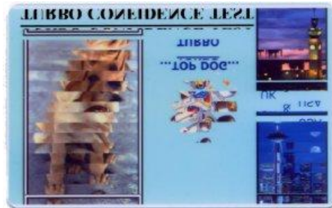
Incorrect Printer Type Selected